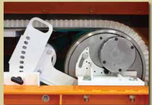
Eccentric Rotor – adjustable rotor placement to maximize separation