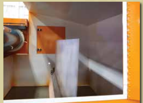
Shroud/Splitter – multiple point splitter adjustment