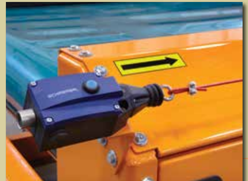
Emergency Stop – safety stops positioned along the belt