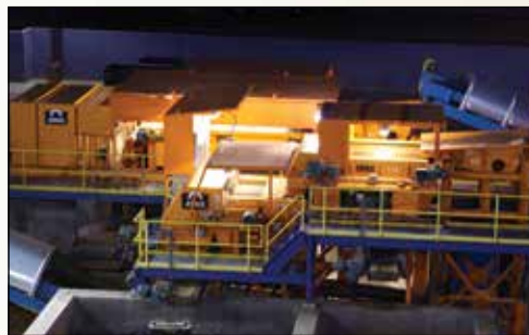
Multiple Eddys in operation processing nonferrous metals at a recycling facility in the Southwest.