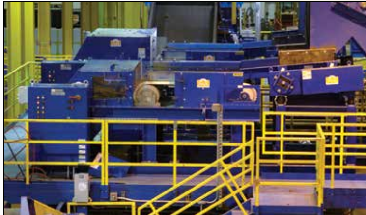
Side-by-side Eddys recover coarse and fine nonferrous material in an auto scrap recycling center in New Jersey.